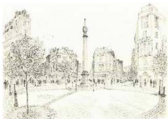
'The Sundial Pillar at Seven Dials' by David Gentleman 21" x 24" (54cm x 61cm)

£95 + VAT @ 20% (£114) + postage & packing in the UK (£5), delivered in a tube = £119.