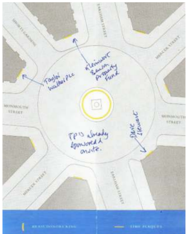
Position of the Time Plaques and the Donors' Ring on the Dials

You also receive a Paul Draper limited edition collotype with a dedication of your choice and your name will be on the new brass donor's ring around the Sundial Pillar which will be installed once this scheme is completed. The cost of sponsorship is a minimum of £20,000 via gift-aid.