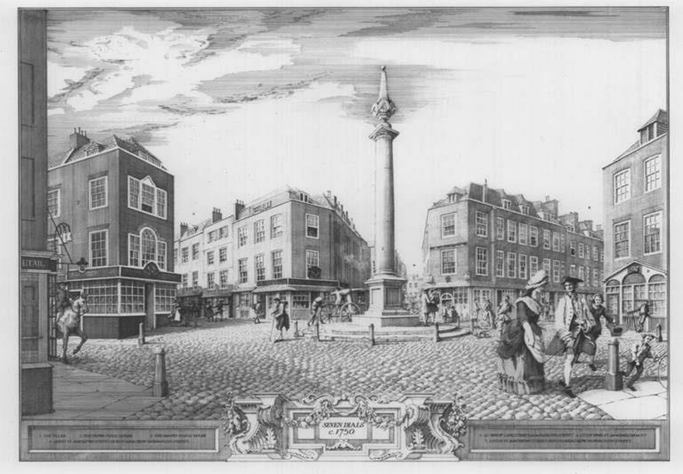
Paul Draper's remarkable drawing of 'Seven Dials c.1750' after the painting by Wm. Hodges. 33" x 25" (84 x 62 cm). The artist's signature, the number and your dedication are inscribed at the foot.